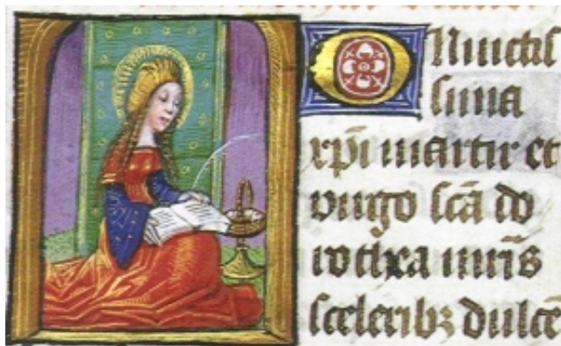
St Dorothy, Netherlandish or North German, ca. 1500 The Fridsam Collection, Metropolitan Museum of Art

The sample from the dryer did not shrink much more than the line-dried sample, which was under five percent. It did not full. It did not fluff. I couldn't brush up a nap. I thought that surely, as sticky as it was on the loom it would come out of the dryer with fuzz standing up half an inch high. Not only that, but the washed and dried samples now look like some strange plaited twill, with tracking going every which way. It is only slightly heavier than some commercial yardage I used for a surcote, but I think that twenty three yards of the fabric will be far too heavy for a dress for Southern California. Therefore, more sampling is in order. I plan to try again, this time with a slightly more open sett, and to weave both plain and 2/2 twill. Hopefully, I will have both samples and photos of the finished dress for next year's issue.